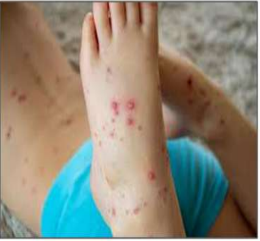
Fig.1-Hand and Foot syndrome Fig.2-Coxsackievirus infection in children.